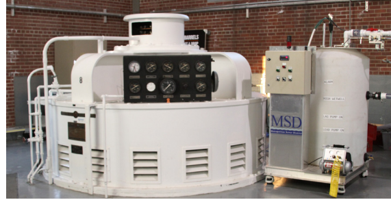
Beargrass Pump Station

will take time to implement. MSD alerts the public when overflows occur by posting signs, providing information directly to the nearby community and putting up-to-date information on our website.