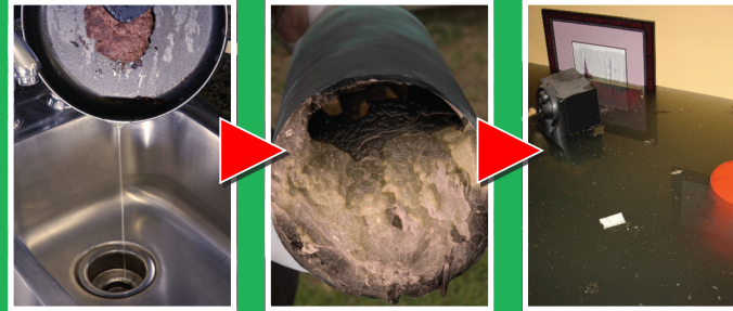
Fats, oils, and grease (FOG), create clogged pipes that lead to basement back-ups.

When greasy wastes are washed into the plumbing system through your sink or garbage disposal, they can stick to the pipes. Using your garbage disposal or a grease-cutting detergent does not keep FOG out of the plumbing system. Garbage disposals shred solid material into smaller pieces, but do not prevent FOG from flowing down the drain. Grease dissolving detergents can pass FOG through your household plumbing but the grease will still cause problems in the sewer lines.